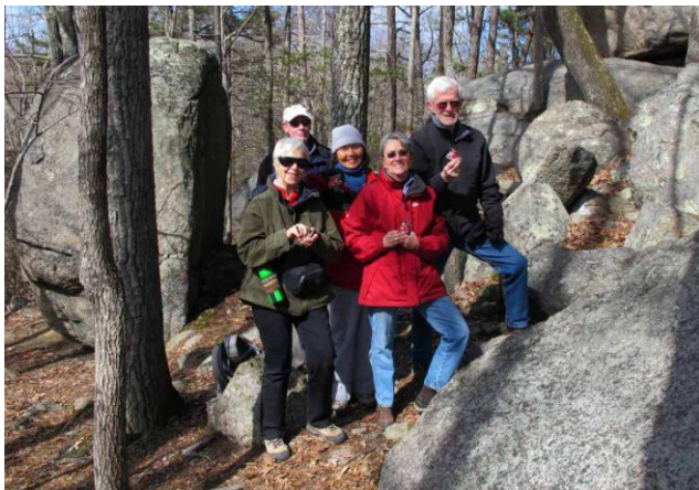
Indian Rock Hike