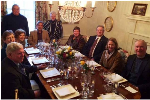
Farmhouse Dining at Veritas Winery