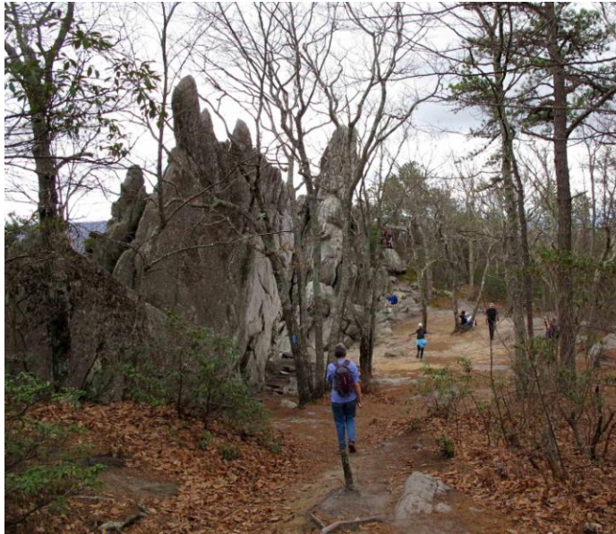
Flats of Dragons Tooth