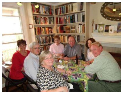
Lunch at Stone Soup Café, Staunton

The Dining Out groups go out in January, March and October. Members are encouraged to host a group of eight for breakfast, lunch or dinner at a local or near-by restaurant. Groups can try new places or revisit old favorites. If you're interested in joining the group when we gear back up in October, please send an e-mail to Copper Perry at skipandcopper@yahoo.com