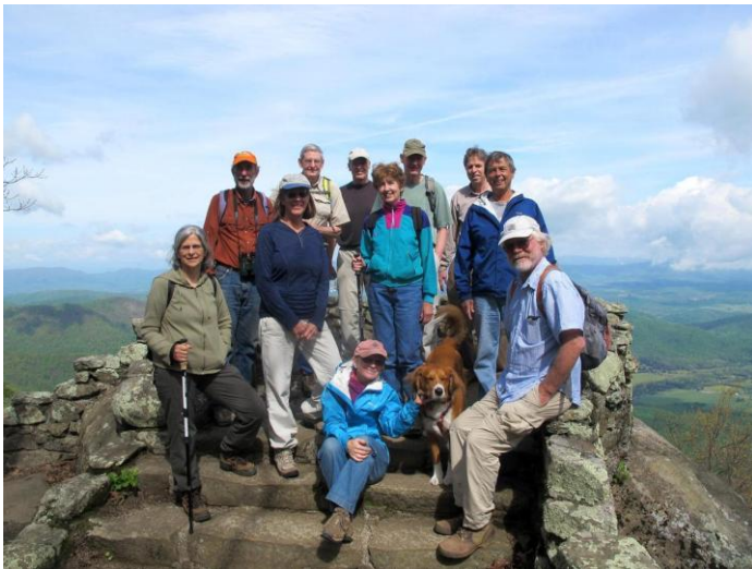
Thunder Ridge Overlook