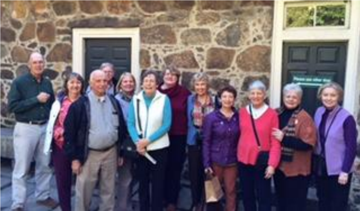
Tour of Richmond