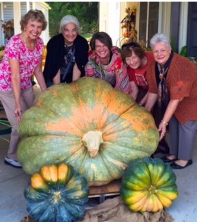
Fall Harvest Tea

MANY MORE PHOTOS FROM RECENT NEWCOMER ACTIVITIES, INCLUDING OKTOBERFEST, WILL BE ONLINE SOON AT THE NEWCOMERS WEBPAGE http://lexvanewcomers.org/