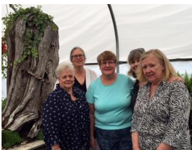
Butterfly House at Back Home on the Farm

http://www.lewisginter.org/visit/dominion-gardenfest-of-lights/