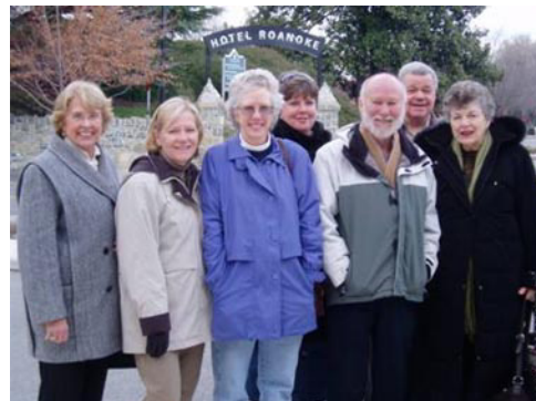
In January the activity group enjoyed museums and lunch in Roanoke.

The March 5th general meeting will be at the Wingate Hotel on Rt. 11 at 10:00 AM.