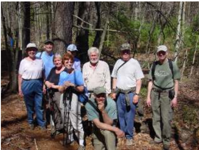
April 2 Hiking the Appalachian Trail to Speer's Pond.