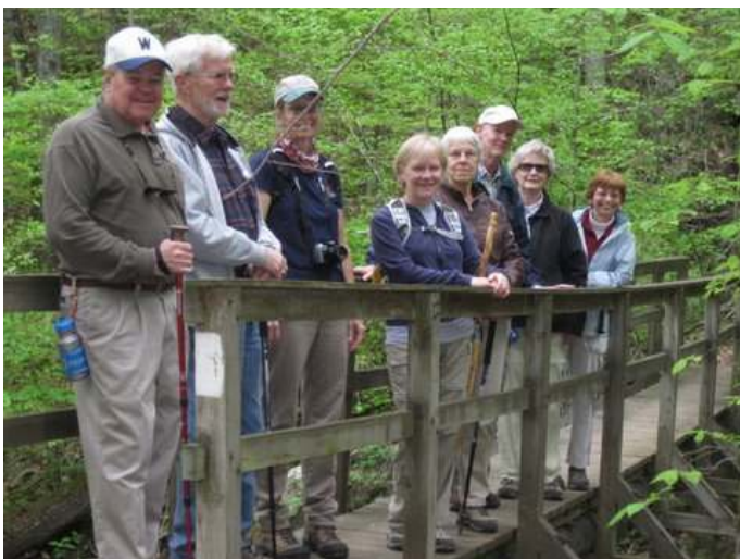
Brown Mountain Trail