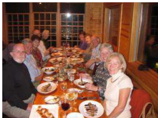
House Mountain Inn