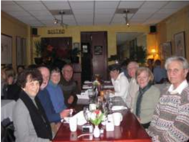
Dining Out at the Bistro on Main Street

Fifty two members enjoyed one of the 6 Dining Out venues in January. The next round will be in April. Consider being a host / hostess. Contact Susan & Ed Bauer to learn more, join the mailing group, or offer suggestions at eddiebauer@comcast.net or call 540-463-2018