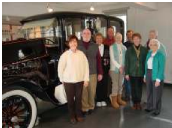
Trip to Woodrow Wilson Presidential Library

Monterey, VA where we'll spend the day looking over the arts and crafts that will be available for purchase, enjoying the afternoon music highlights, learning about maple sugar production, and generally consuming all products made of or with maple sugar/syrup.